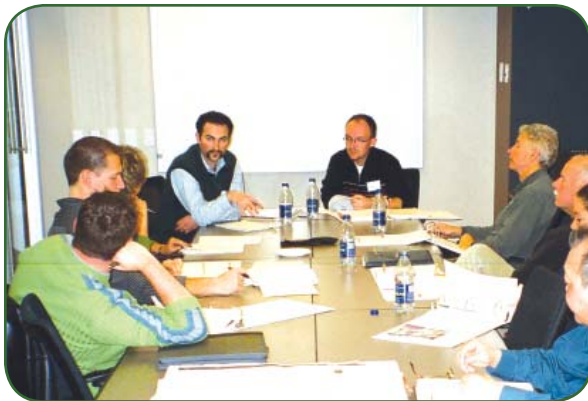
PIP brings people together to learn urban planning.