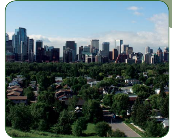
Calgary is a city made up of many vibrant communities and dedicated volunteers.