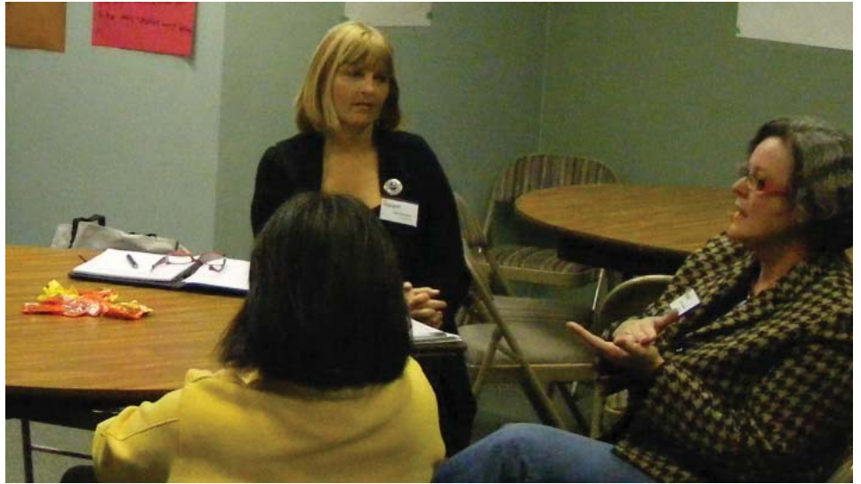
Administrator Meetings offer community association staff great opportunities to sit down with peers and discuss important issues and challenges faced in their position.

Each month, chapters from the newly developed Federation of Calgary Communities Resource Toolkit will be made available to our members in an effort to revisit their own bottom lines and offer helpful tips and solutions to every day challenges in the not for profit sector. The Resource Toolkit content will cover all things vital to organizational development, and each chapter has been colour-coded to add a flavour of distinction to the topic of the month. These will be available electronically through the network and also on the Federation's website.