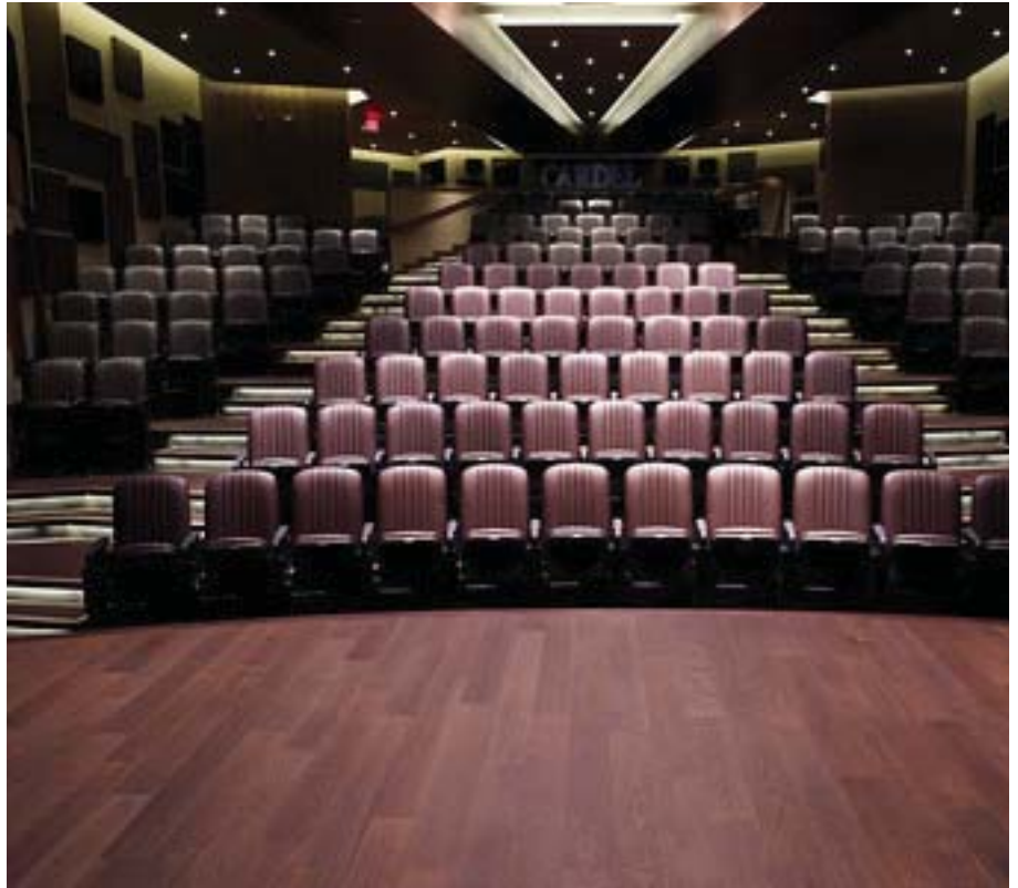
The fully equipped theatre features digital HD projection on a massive screen along with theatrical Dolby Surround engineered audio. WiFi and tablet arm seating making it a great resource for Calgary Not for Profits

Those interested in booking the Cardel Theatre can get complete step-by-step details www.cardeltheatre.com . For more information, please contact the Theatre Planner at 403-258-1511 or info@cardeltheatre.com .