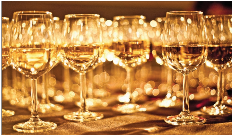
The Lake Bonavista Community Association's International Wine Tasting event will take place on April 17.

Typically, the event brings out over 100 attendees and is highly popular in